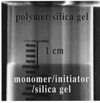
FIG. 1. A polymerization front with a monomer and a polymer separated by a very sharp concentration gradient. Silica gel is used to prevent convection. Adapted from Ref. 2.