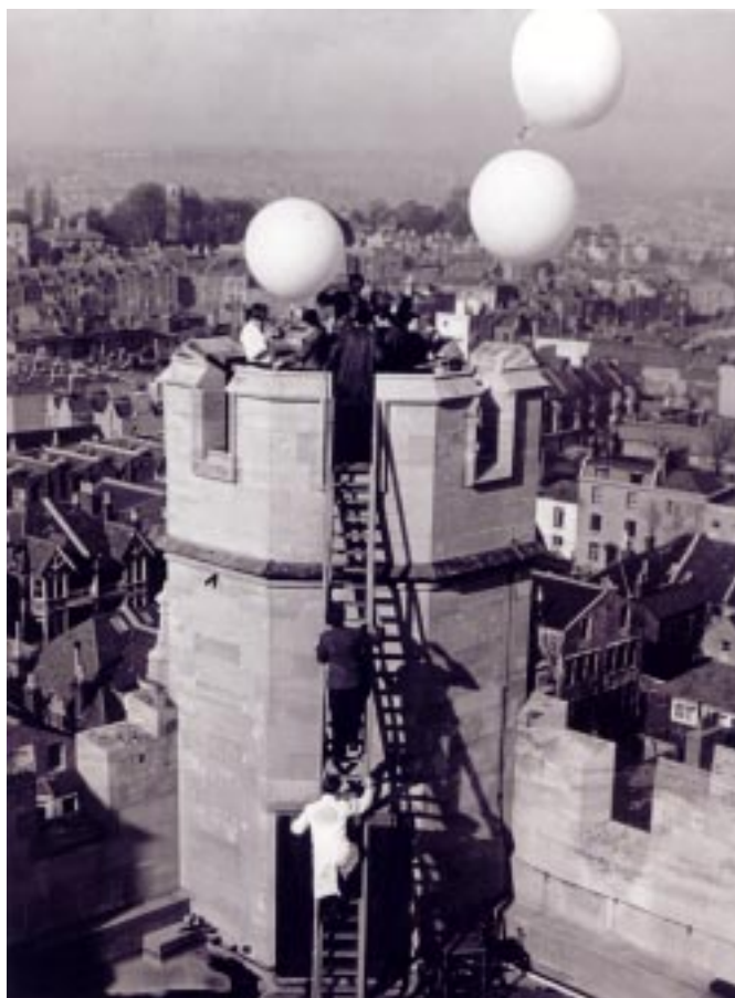
Balloons were at the heart of Cecil Powell and Peter Fowler's cosmic ray research, here launched from the top of the Bristol University Physics Building.