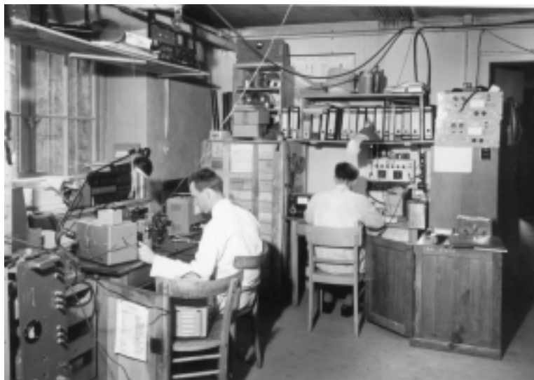
Research laboratory, Nuclear Institute, Strasbourg, 1954.