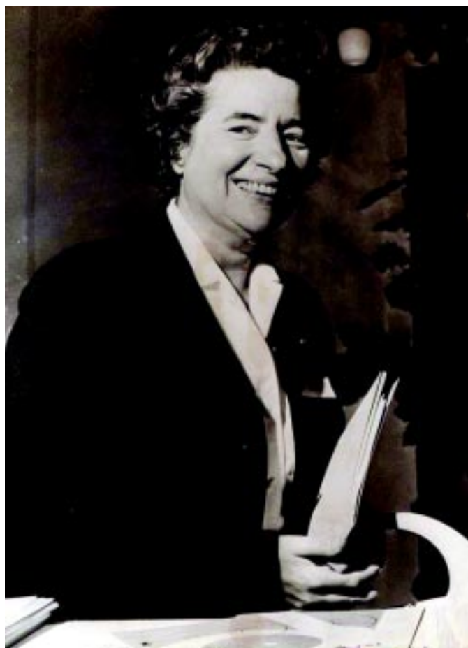
Marguerite Perey, French radiochemist.