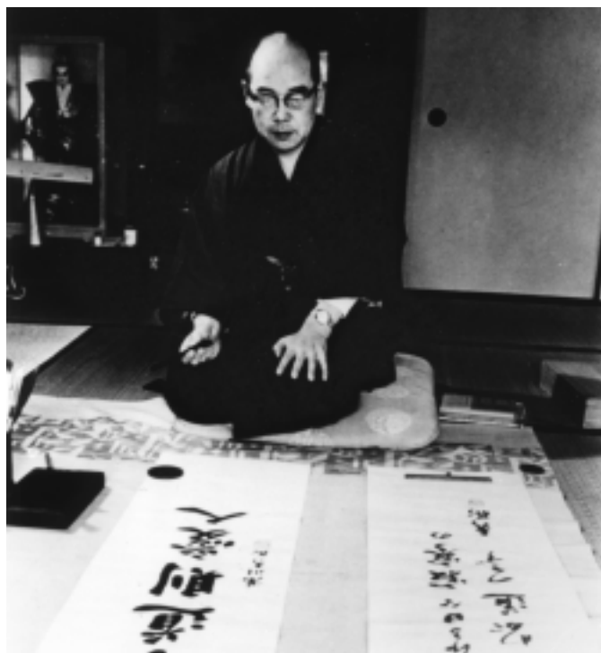
Hideki Yukawa in his house, doing calligraphy, March 1962.