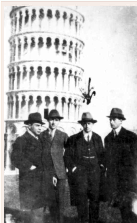
LEFT: Enrico Fermi (at left) with a group of physicists that includes Ettore Majorana, by the Leaning Tower of Pisa, date unknown.