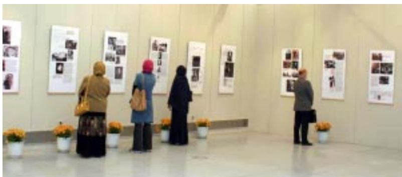
The Bibliotheca Alexandrina in Alexandria, Egypt will host one of the major World Year of Physics symposia celebrating Einstein in 2005. The Library has already opened to the public an extensive poster exhibit on Einstein's life. The posters, created by the AIP Center for History of Physics in 1979, are also the basis for the Web exhibit www.aip.org/history/einstein . The entire exhibit can now be downloaded in PDF format and printed out.