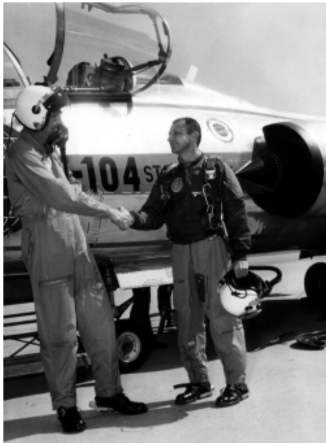
Luis Alvarez after the first flight at Mach 2, 1963.

The Académie des Sciences, Archives et Patrimoine historique, Paris, France has sent us the finding aids for two of their collec-