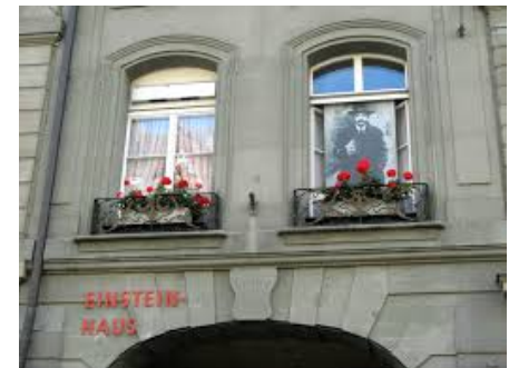
Einstein House in Bern First EPS-APS Joint Historic Site