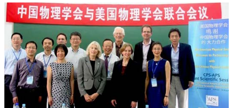
CPS-APS Leaders at CPS Annual Meeting