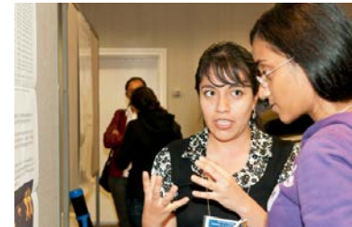
CAM Participants – Poster Session